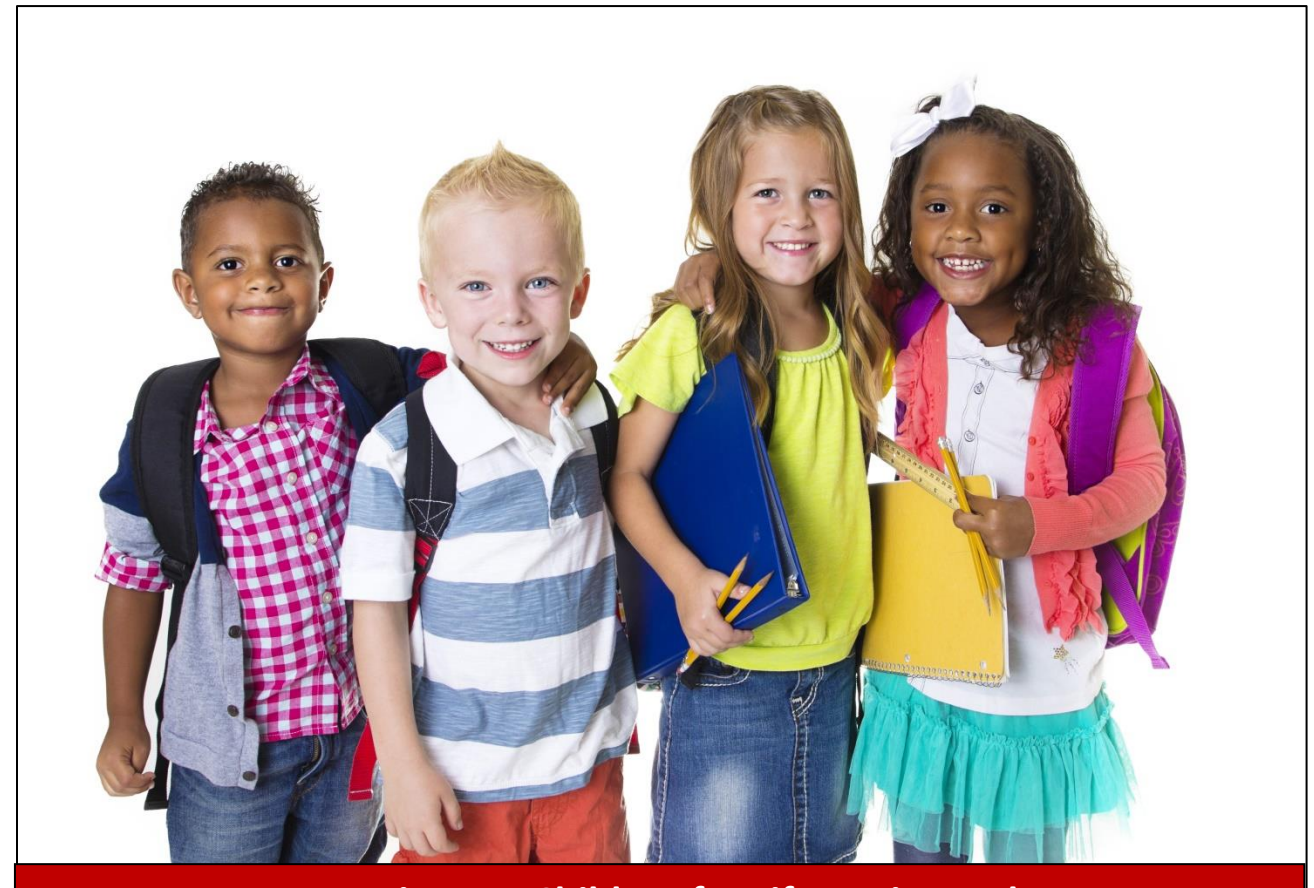
Preparing our Children for Life Begins Early