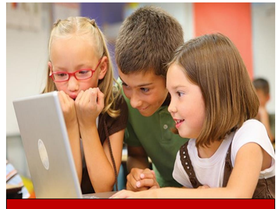
Creating an environment where students become excited about learning!